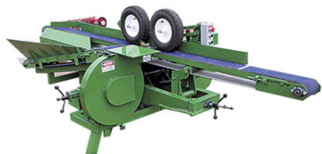
Low Profile Band Resaw

More Equipment from SAWMILL SUPPLIES & EQUIPMENT: _____